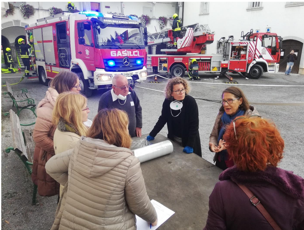
Photo: Workshop on rescue of artefacts, Technical Museum of Slovenia, Bistra, October 2018.

SZPV gained first experience in project FIRESKILLS (project no. 2017-1-TR01-KA202-045607) with partners from Turkey, Denmark and Italy, working on education of firefighters on preventive precautions and emergency procedures on fires in historic buildings.