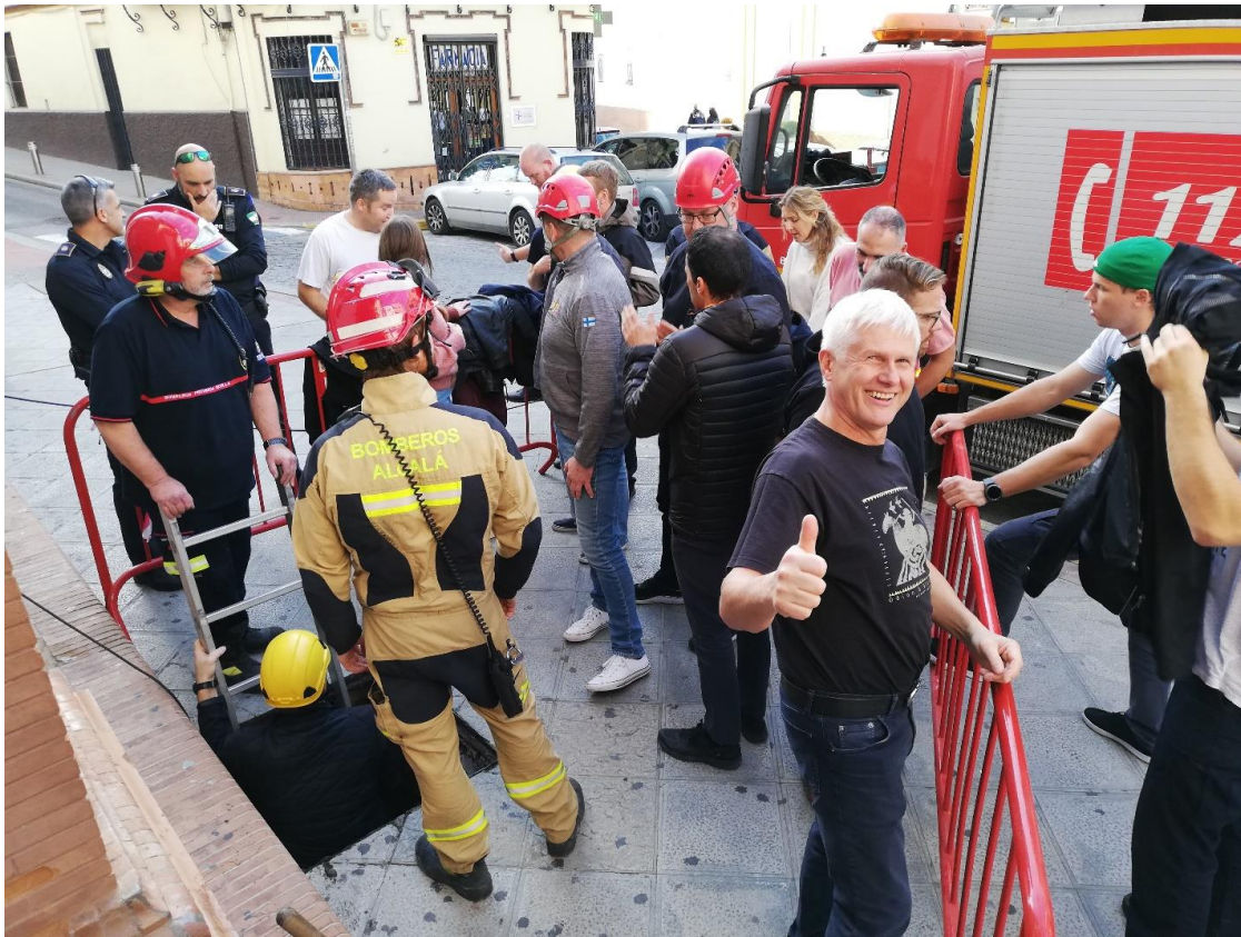
Photo: Visit of historic underground flour watermill, Alcalá de Guadaíra, Spain, December 2019.